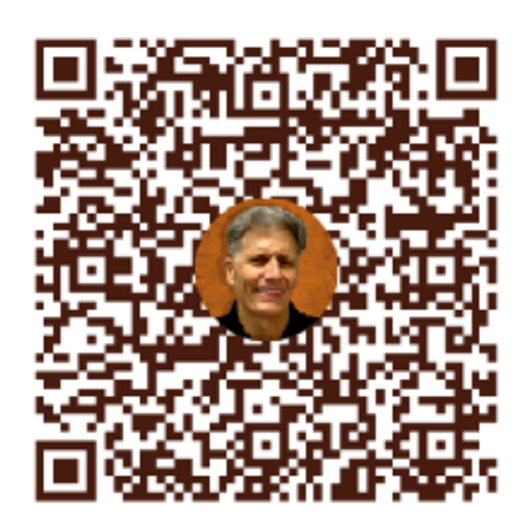
...or visit this url address @: www.OneMoreFish.net/skip

or more Bible Study Lessons like this one.