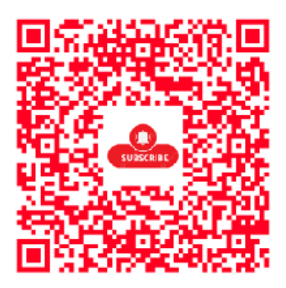
...or to visit:

Note: Please "SUBSCRIBE" to our new online ROSTER Listing to continue to receive Bible Study notifications, Preview Outlines and Study Lessons as we will be moving away from individual text notifications soon.